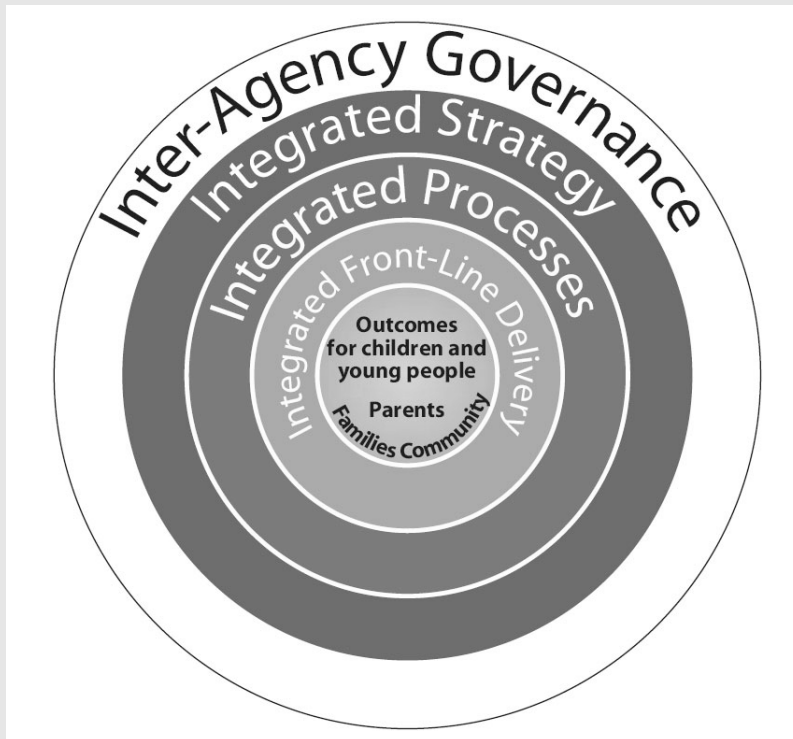
Figure 2 Onion diagram – model of a Children’s Trust