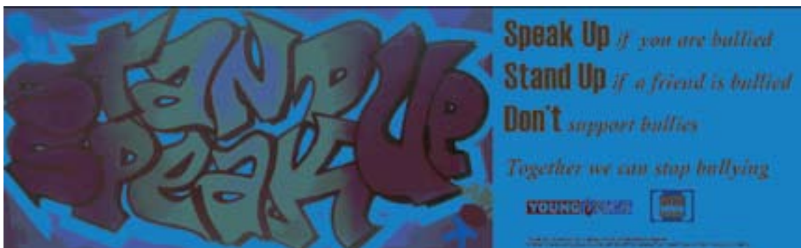
Poster designed by young people in the LIFT Community Trust youth project Quinton Birmingham and used for Anti-Bullying week 2005 by Young Voice and Anti-Bullying Alliance. Used on buses. Another version used on trains.

Young people in the LIFT community trust youth project at Welsh House, Quinton Birmingham created a poster to counter bullying. This was converted into formats for school notice boards, bus interiors and advertising panels on trains. The advertising spaces were booked and the posters ran for two months on buses and trains. Copies were provided free to schools, youth clubs and any setting requesting them. Young people used the slogan in other anti-bullying work such as plays and songs.