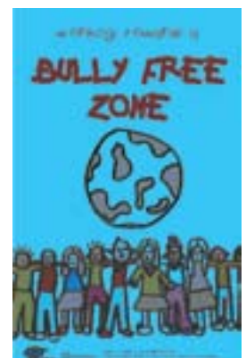
Poster for bus shelters developed by children in Camden Children's Fund anti-bullying initiative, with 4Children and Young Voice.

In Camden, a series of workshops were conducted with young children on the issue of bullying. Through the use of specially adapted music, theatre and cartooning workshops, the children described locations where bullying took place. These included bus stops, subways, the canal, alleyways, park play areas and outside shops. The children created slogans and designed posters that were printed and displayed in the panels at bus stops to make clear that they should be 'Bully Free Zones'. A pack was developed and distributed to play centres, schools and clubs in the borough. It contained posters and postcards of children's work and advice to the setting, 4Children and Young Voice provided training for street wardens and local authority staff in preventing bullying in those areas. Proactive steps were taken to include children with special needs.