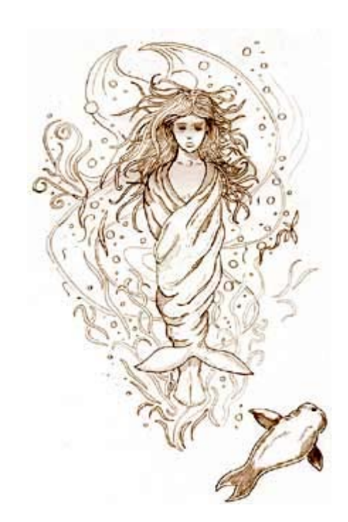
Figure 3.1 Illustration of a silkie

Examples of this included the silkies (seal people) found in the Orkney Isles who had webbed fingers and toes or the Aberdeenshire Brownies who had no separate fingers and thumb. Treatment of such creatures was varied. In the case of the Changeling found in Celtic folklore they were deemed to bring either luck to a community or be a bad omen. In the case of the latter, treatment of the Changeling included being placed on a red-hot shovel, pressed into red hot ashes, laid on a red-hot grid, being fed with leather or red-hot iron or being made to drink poison (Haffter, 1968).