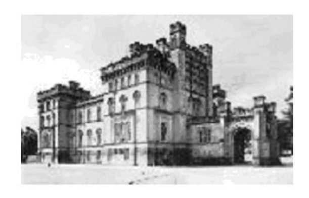
Figure 3.3 Lennox Castle Hospital, Lennoxtown, near Glasgow

"Typical punishments took the form of withholding privileges such as cigarettes, or confining patients to the ward. For serious misdemeanours, individuals could be made to stay in bed all day. This was called 'pyjama punishment." (Orme, 2002)