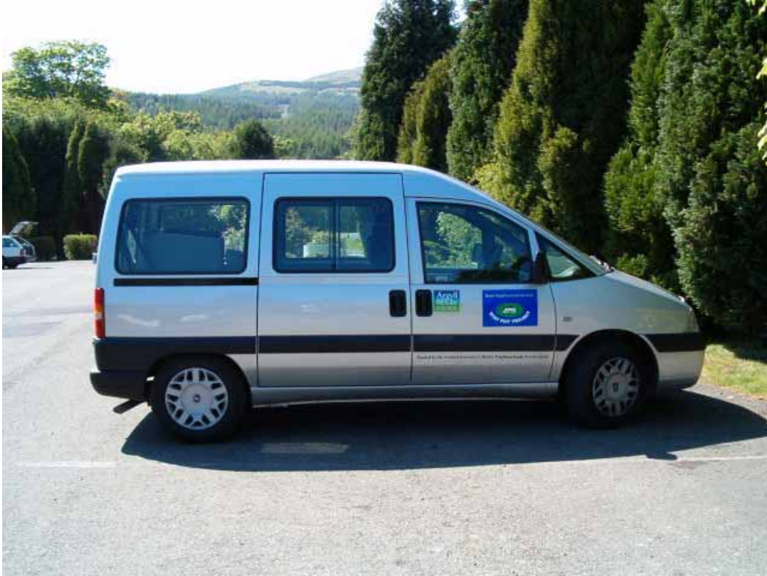
‘Keeping in Touch Service’ – escorted wheelchair accessible transport from the “Stay-Put” Project

We recognise the need to support and provide more flexible transport services to people who cannot use public transport or where public transport does not exist to ensure access to public services.