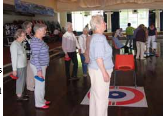
'Kurling' Club, Bute

The work carried out in Bute and Cowal has resulted in a number of achievements, including;