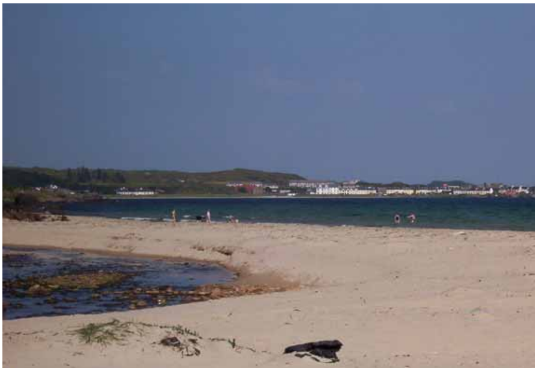
Port Ellen, Islay