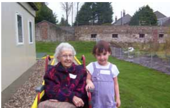
Opening Kintyre Network Centre – provides respite for carers

We recognise and value the crucial part carers play in families and communities throughout Argyll and Bute. It is therefore important that communities support them. It is important that we care for the carers.