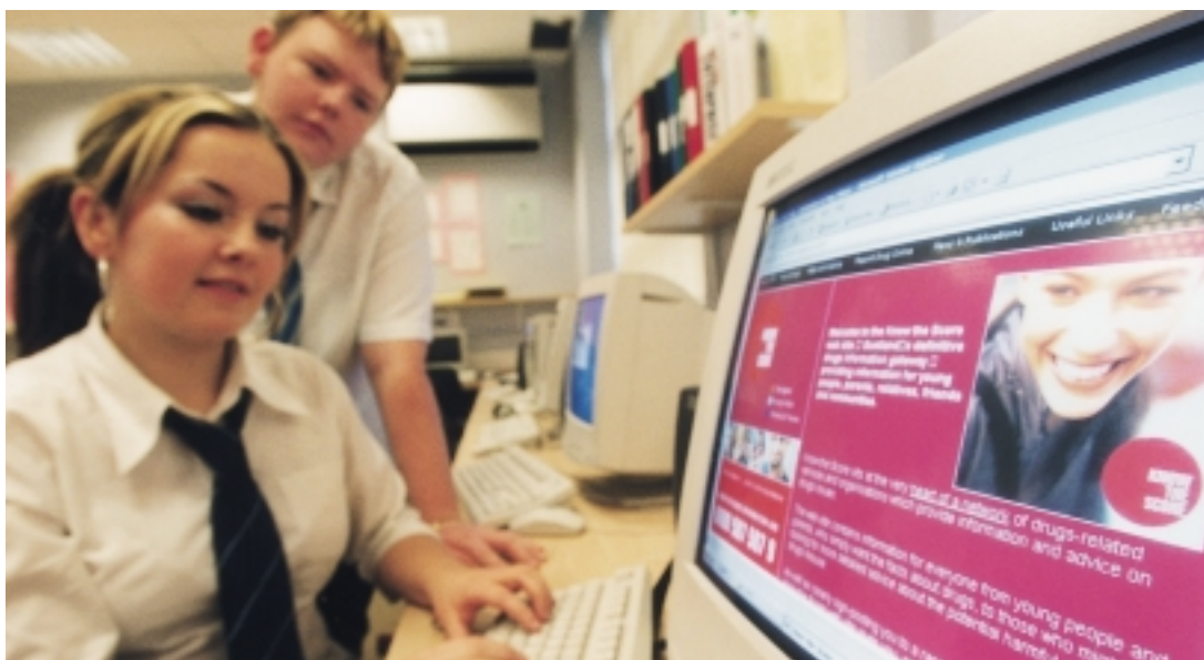
The Know the Score website – an integral part of the National Drugs Communications Strategy