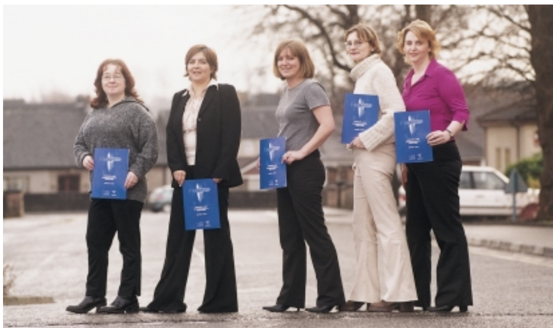
Staff from Signpost Forth Valley, a groundbreaking community project for drug misusers and their families