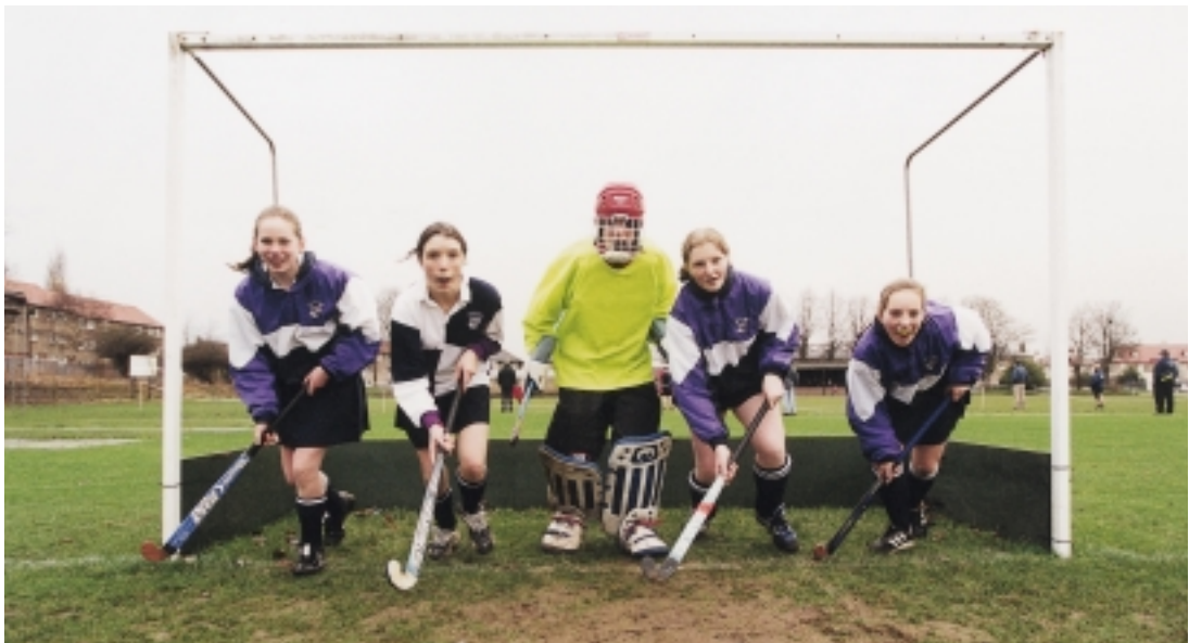
Sport is a good example of how youngsters channel their energies in a positive and enjoyable way

(the overarching aim is that, by this year, all schools will be able to report that they provide drug education in line with national advice, and all schools will have procedures in place)