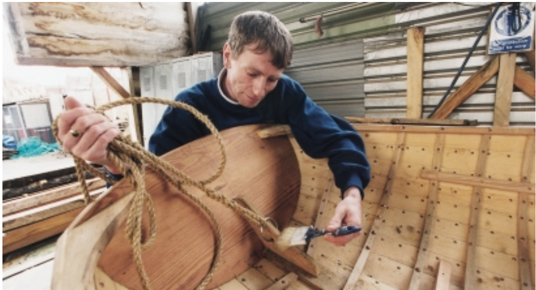
A recovering drug misuser uses his skills at the Gal Gael Project, Govan (funded by Scottish Communities Against Drugs)