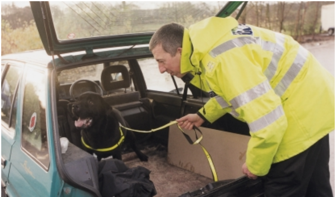
Police use many methods to target drug dealers, including the traditional 'sniffer' dog