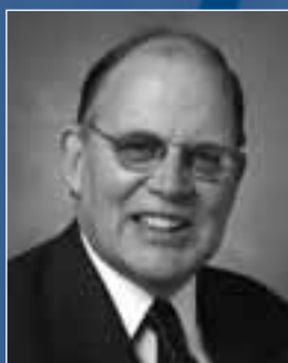
Adam Ingram Minister for Children and Early Years