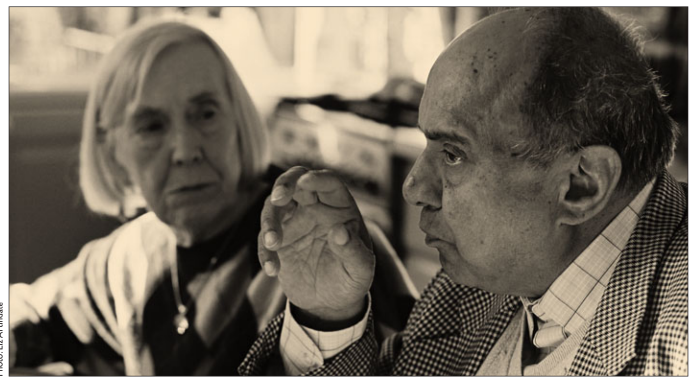
otopiliz A rtindalo