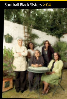
Southall Black Sisters >04