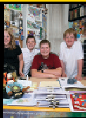
Croeso project >09