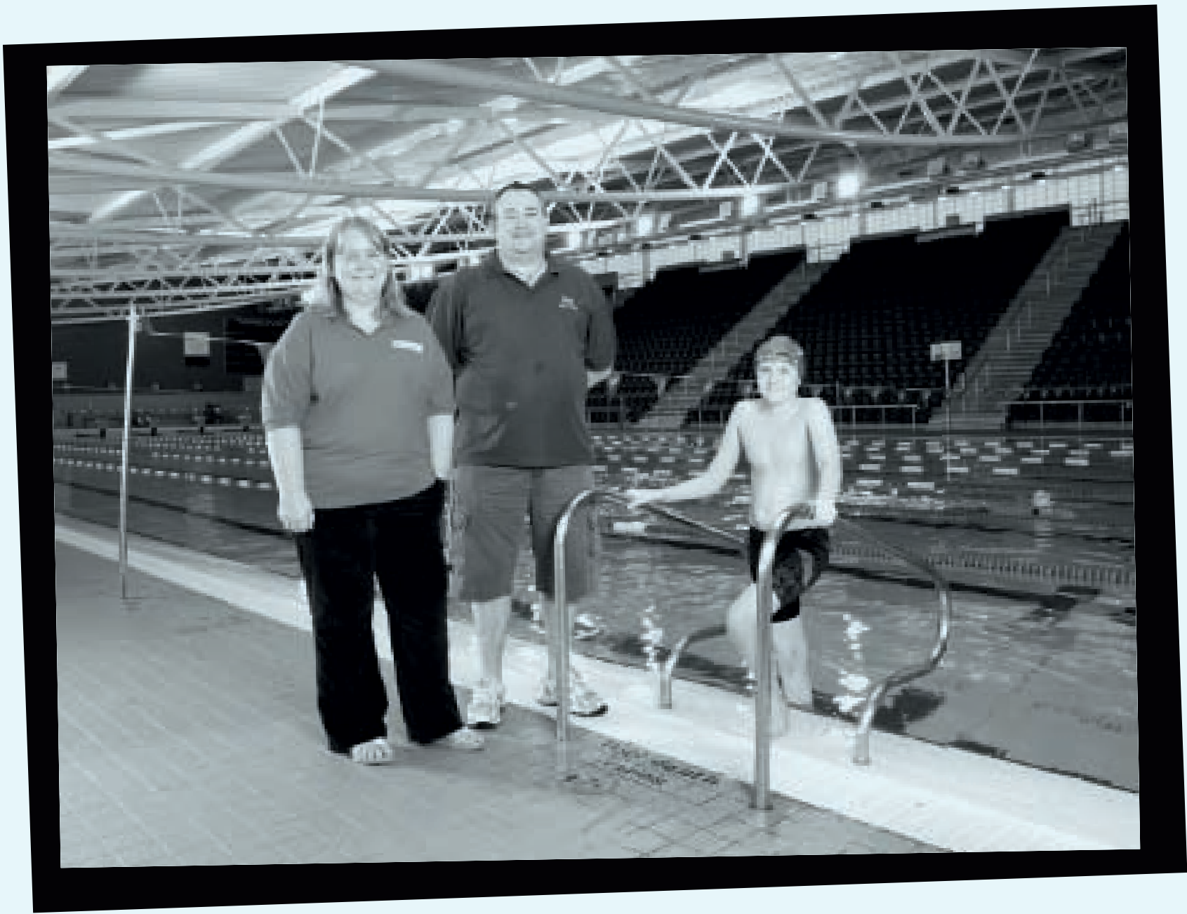
One Year, Ten Stories