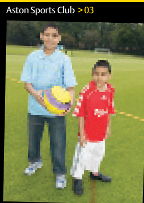
Aston Sports Club >03