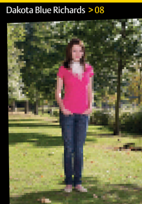
Dakota Blue Richards >08