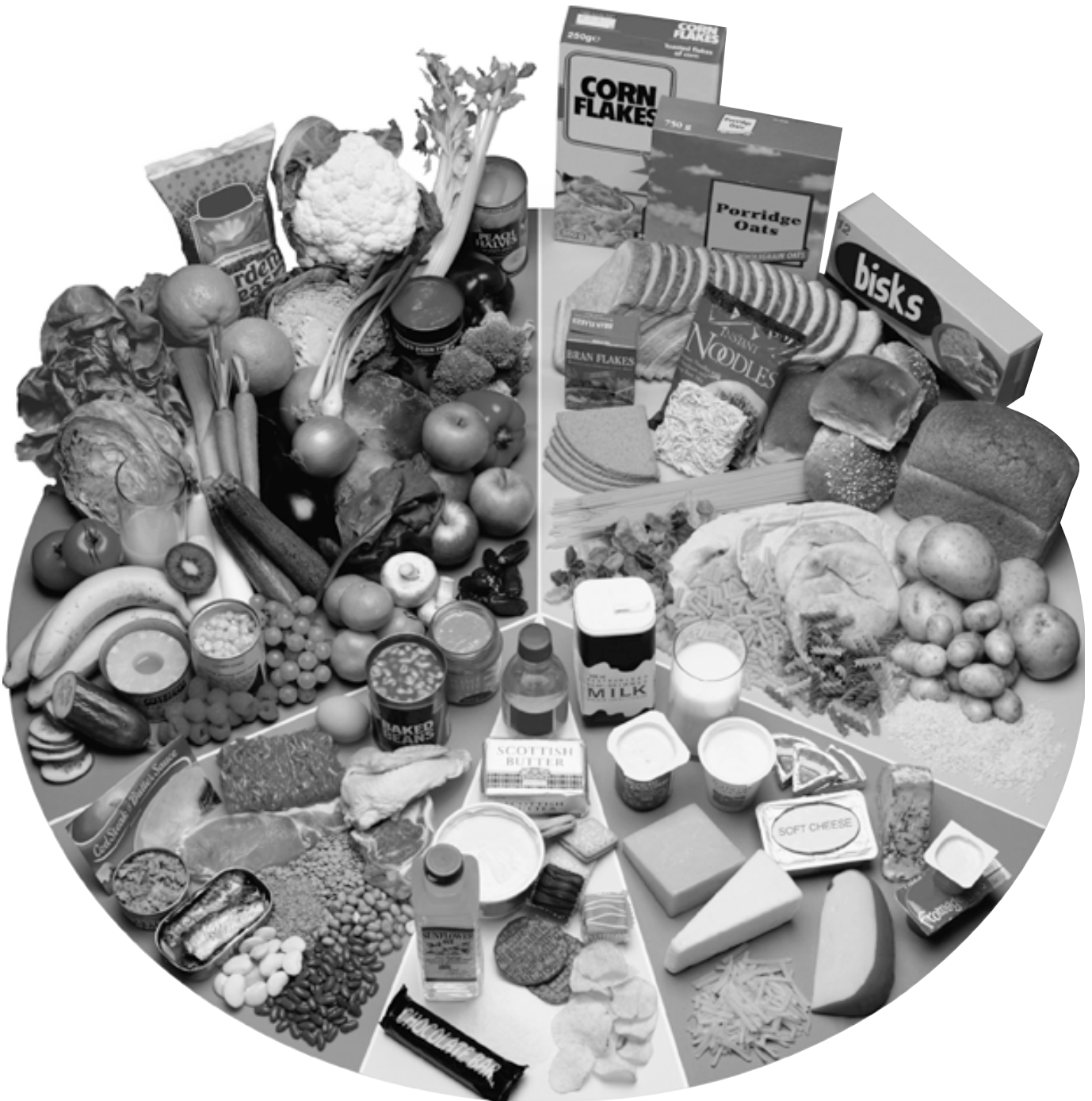
Figure 1: The 'Eating for Health' plate model