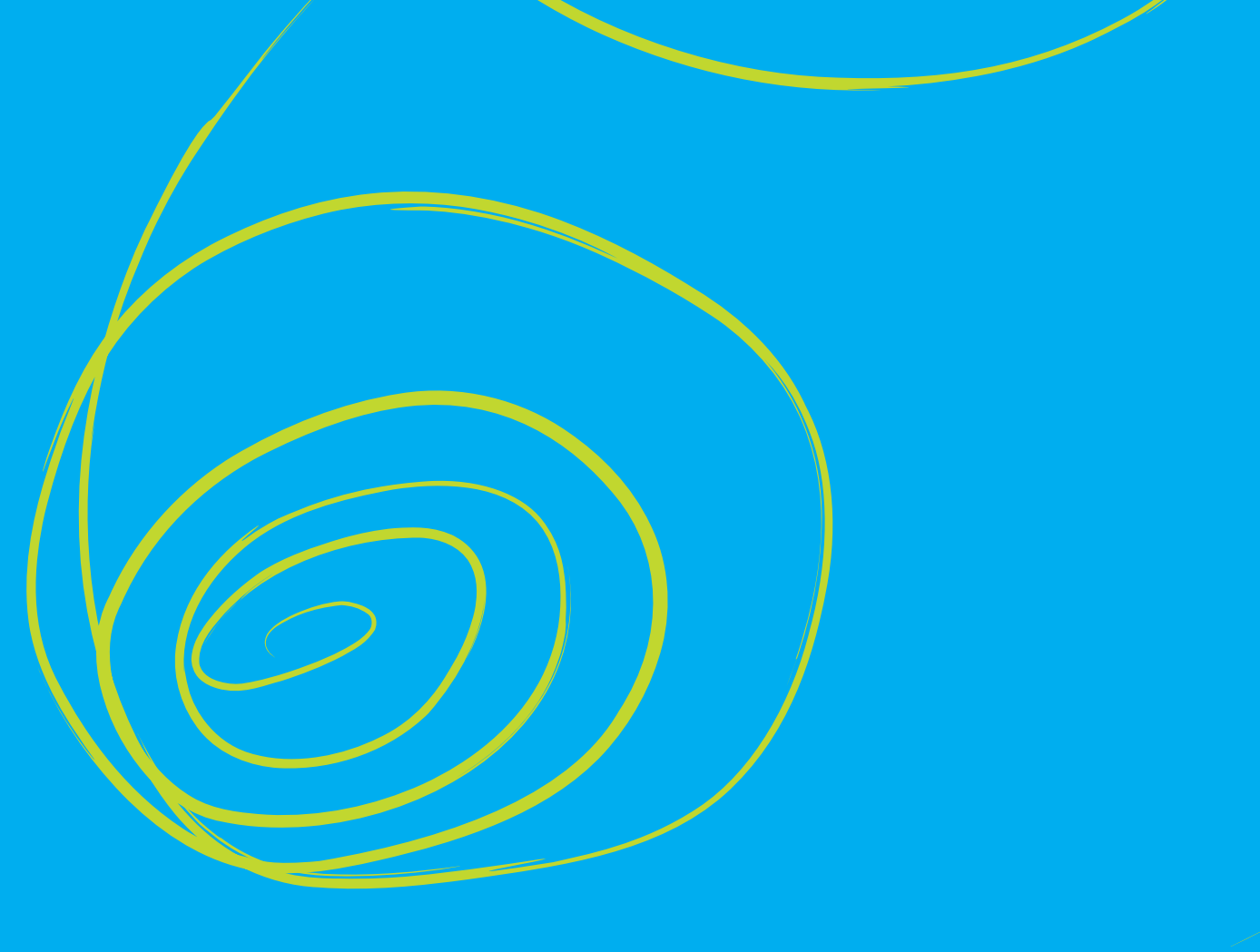
02 / Examples of Practice