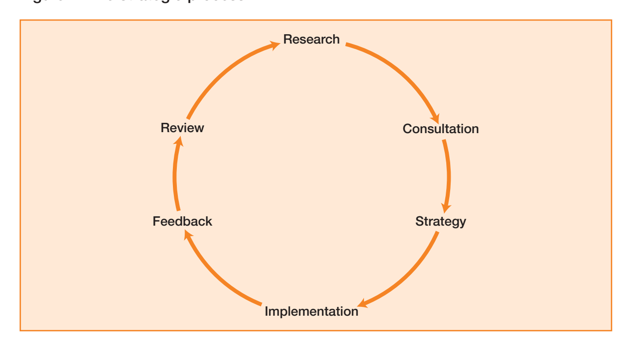
Figure 2: The strategic process

A good strategy should determine priorities for action and help all staff and partners to understand what is needed and why. It should be based on sound evidence and extensive consultation with all relevant stakeholders. It should lead to specific, measurable, achievable, realistic and timetabled (SMART) outcomes that have a clear and beneficial impact on those targeted. Such outcomes should be monitored and evaluated so that they can inform any review of the strategy and its objectives, and lead to progressive improvements. It is particularly important that homelessness strategies with specific objectives for ethnic minority populations should be kept under regular review because the circumstances and needs of most ethnic minority communities change very rapidly.