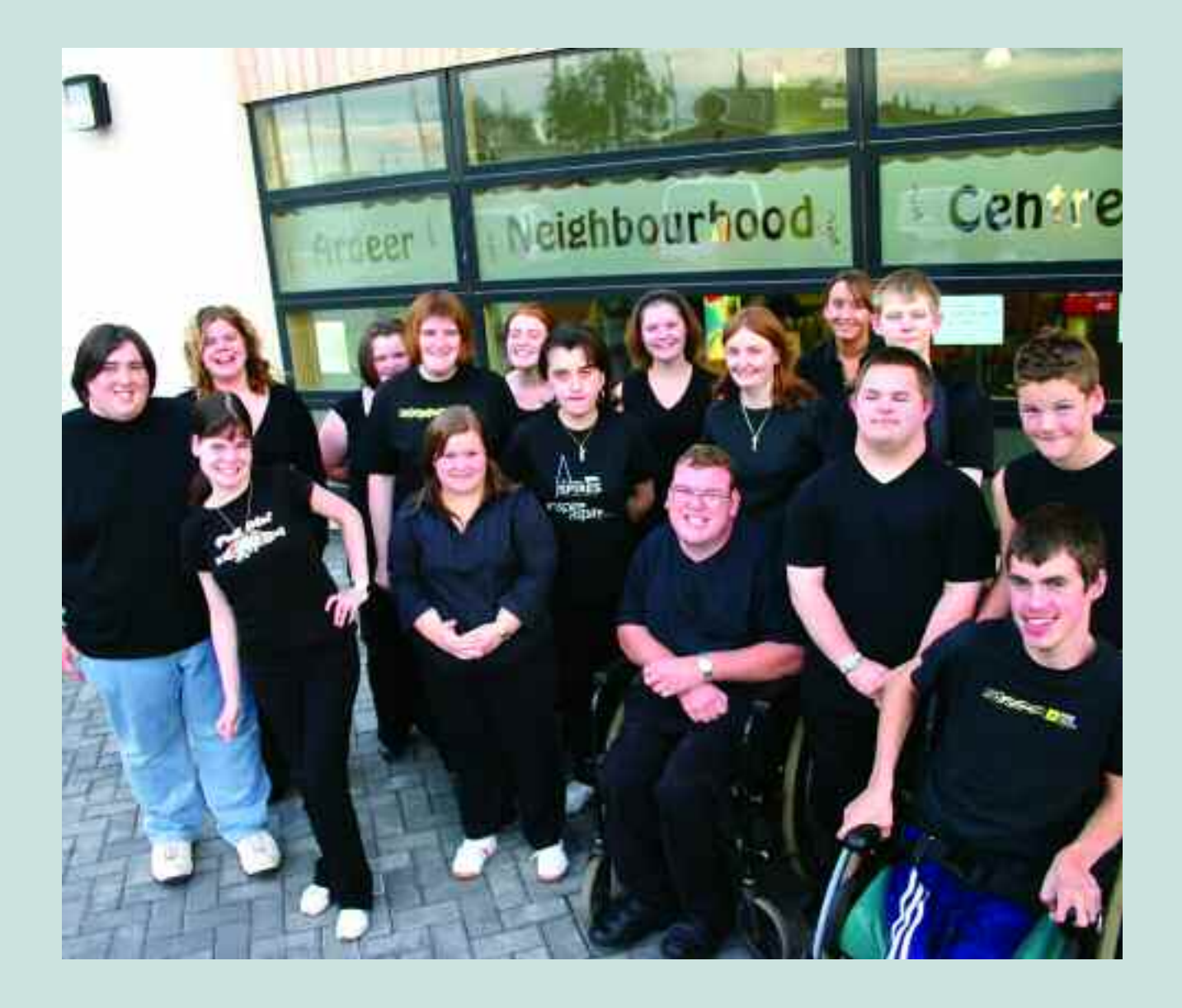
CHAPTER 3 PREPARING FOR ADULTHOOD