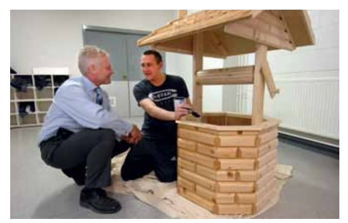
Addiewell Community Partnerships

Community Partnerships are continuing to improve. Glenochil "...continues to develop good links with community-based organisations, with a focus on helping prisoners progress within the system and to reintegrate back in to the community." At Addiewell "Community links are excellent and this area reflects good practice." There are good links with North and South Lanarkshire Councils and with Third Sector organisations. Peterhead has clear limitations in terms of sex offenders being able to access local placements but outside groups do undertake work inside the prison.