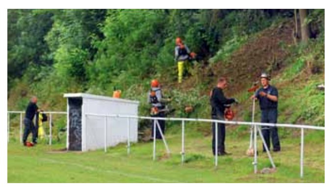
Open Estate Work Placement

The Review concluded that advances have been made in prisoner progression and risk assessment procedures. However it is also clear that prisoner progression relies on decision-making based on good risk assessment processes including multi-disciplinary working. As the report says: '... risk assessment itself is a fallible undertaking.'