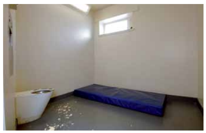
Cornton Vale 'Management Suite'

Mental Health is a particular concern at Cornton Vale and the report highlights that the recommended individual multidisciplinary mental health plans have not been sufficiently well implemented. Prisoners suffering from mental health issues at the prison require a much more caring and therapeutic approach from staff and I was disappointed to see the continued use of the 'Management Suite' cells in Ross House. I have called for better facilities to provide improved separation and care.