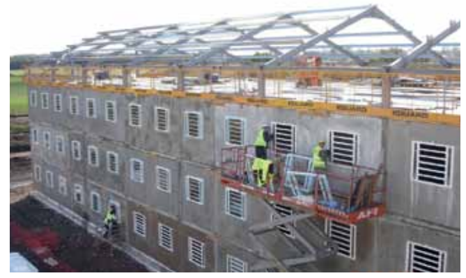
Low Moss under Construction

The Inspectorate recognises that the SPS has made significant investment in developing a fit-for-purpose estate. The new prison being built at Low Moss and the re-development of Shotts are on track. I look forward to commenting on Low Moss and Shotts in next year's report.