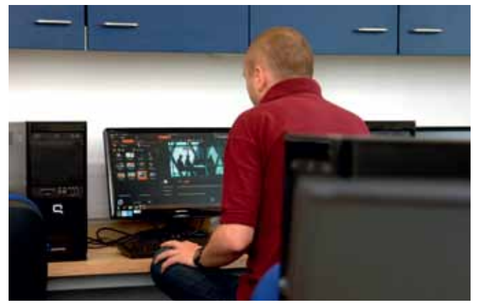
Glenochil Preparation for Release

I am delighted that the Inspectorate has carried out the Progression Review as it sets out how prisons can better progress prisoners through both closed prisons and out of the Open Estate. This document should be essential reading for all Risk Management Teams (RMT). We shall be following up to ensure recommendations on progression are being followed.