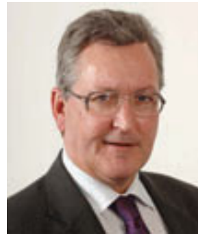
Fergus Ewing MSP Minister for Community Safety

We realise that problems cannot be turned around overnight, but by promoting positive outcomes and tackling the causes of antisocial behaviour we will improve the quality of life of everyone in our communities for the long term and, as a result, help Scotland to flourish.